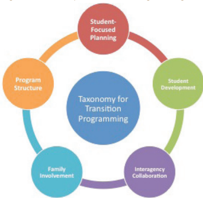
Figure 1: Taxonomy for Transition Programming.

Increasingly, the focus in evidence-based practice is turning to results. Researchers seek longitudinal data on secondary transition practices that lead to positive post-school outcomes (NSTTAC 2010). Statistics, research, and practices will be discussed within the organizational frameworks of Kohler's Taxonomy and three broad categories of post-school activities: post-secondary education, employment, and independent living.